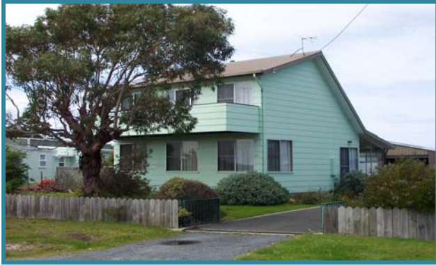
ST HELENS HOLIDAY HOME