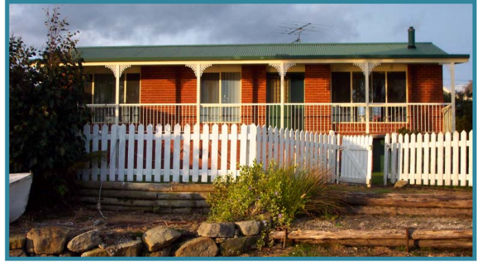
SOUTHPORT HOLIDAY HOME