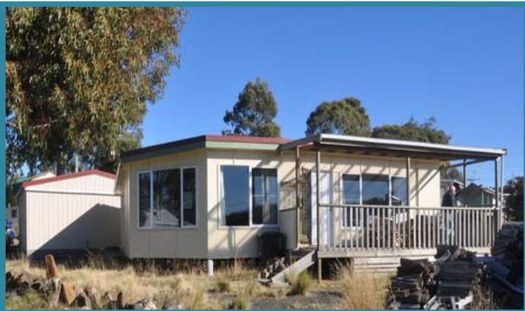
ARTHURS LAKE HOLIDAY HOME